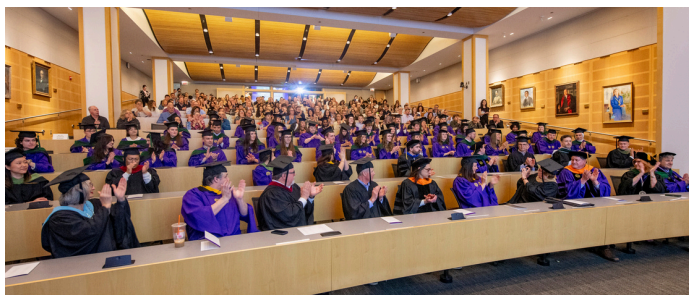
NUPOC faculty, Master of Prosthetics and Orthotics Class of 2025, along with family and friends, celebrating at graduation.