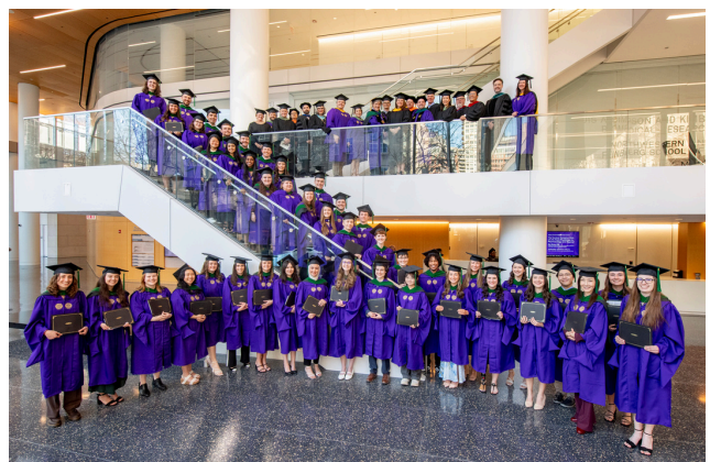
Master of Prosthetics and Orthotics Class of 2025 at their graduation on March 28 th , 2025