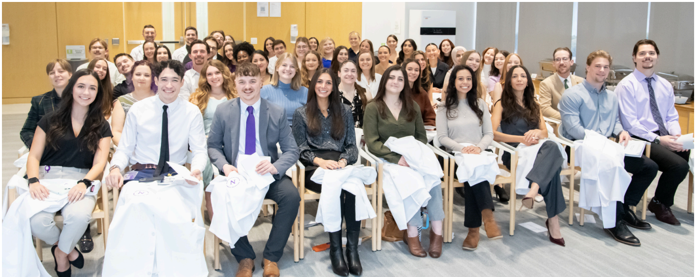
Master of Prosthetics and Orthotics (MPO) Class of 2026 students sitting together at their White Coat Ceremony on January 31st, 2025.

On January 31st, 2025, NUPOC celebrated the Master of Prosthetics and Orthotics (MPO) Class of 2026 at their White Coat Ceremony. This milestone event marked the students' transition from the classroom to clinical training, symbolizing their dedication to patient care and the profession. Faculty, staff, friends, and family gathered to support in-person and on Zoom to celebrate the next generation of O&P professionals as they donned their white coats for the first time. Congratulations to MPO 2026 as they embark on this next phase of their journey!